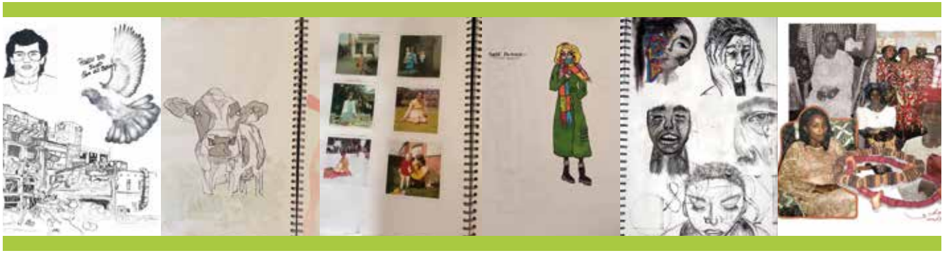
PAST CPJ CONTENT FROM STUDENTS