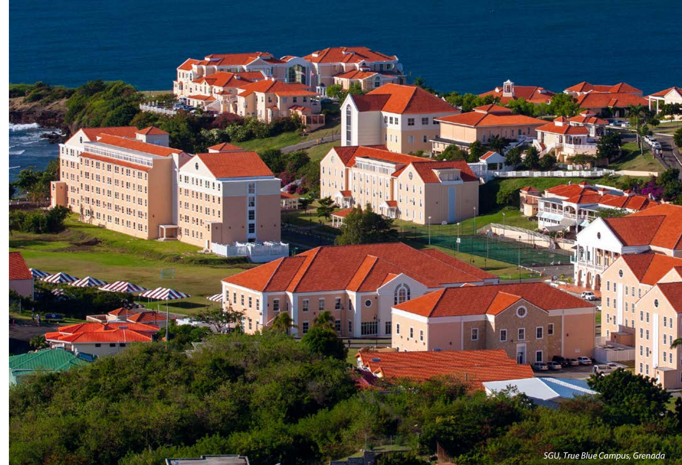
SGU, True Blue Campus, Grenada