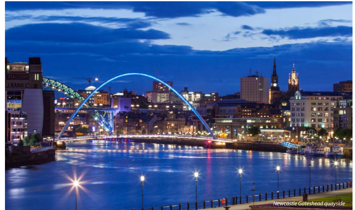
Newcastle Gateshead quayside