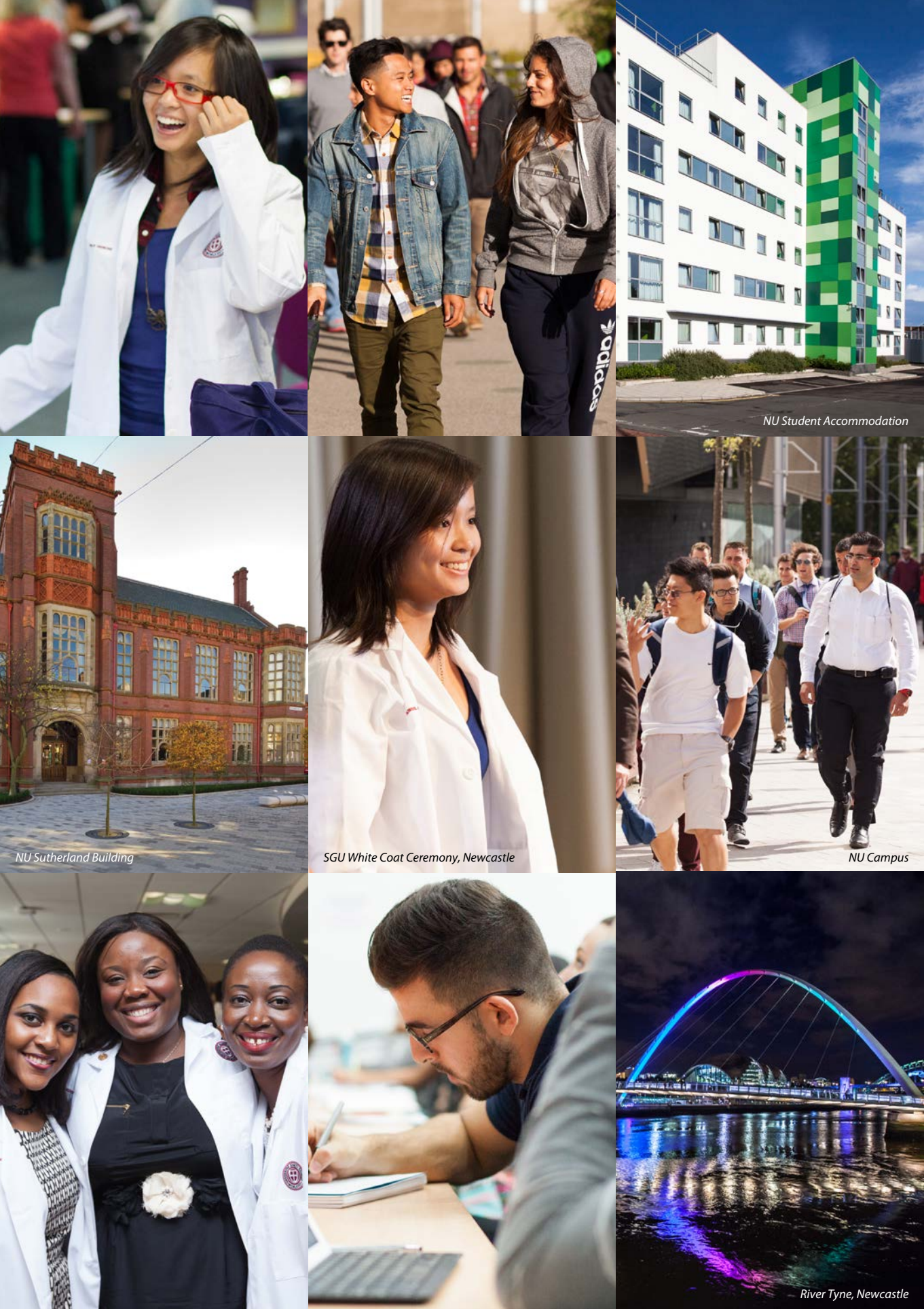
NU Student Accommodation