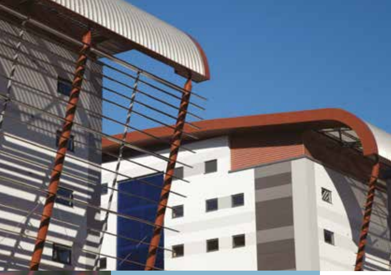
Northumbria's University Library is ranked joint 2nd in the UK alongside Cambridge in the Times Higher Education Student Experience Survey 2015.

In 2014/15, Northumbria is ranked 2nd best in the UK for student accommodation and is top 3 for best student community ; best value for money; and best customer service.