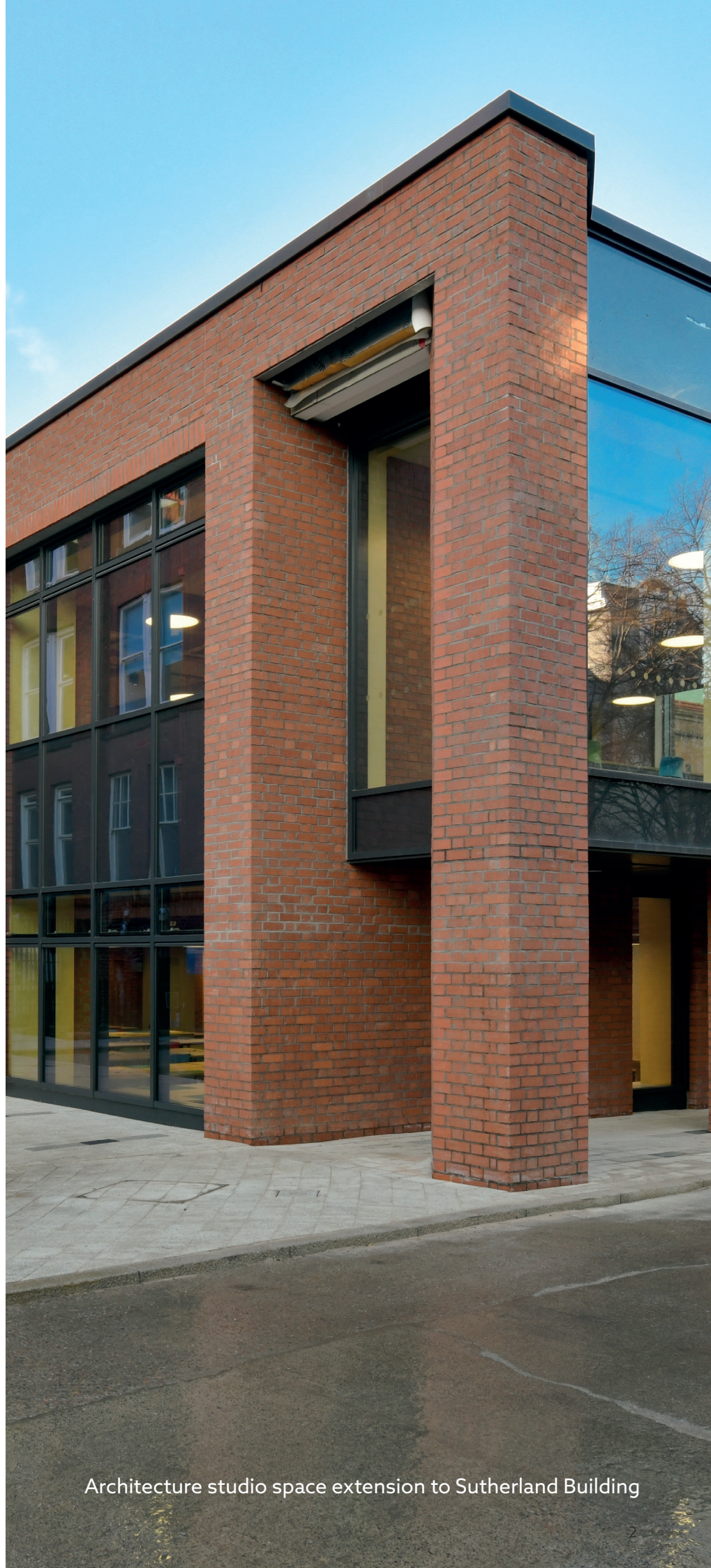
Architecture studio space extension to Sutherland Building