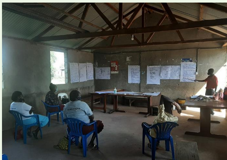
Figure 4: Workshop with Volunteers and Primary Actors, Scenario Building Activity, Moroto District.

Participatory workshops with primary actors and former volunteers included an exercise on designing potential future projects for VSO. This exercise showed that VSO is well established on the ground in Uganda and there is a strong appetite for future interventions through the blended volunteering approach. Participants embraced VSO's previous projects in different areas, such as piggery, poultry and hairdressing, and reflected on ways to further integrate livelihood components into these types of projects in the future. In designing their perfect project, and considering the blend of volunteers that they would choose to be involved, participants reflected on the value of a mix of community, national and international volunteers but especially highlighted the central role for community volunteers in ensuring project success due to their familiarity with the context and particular needs.