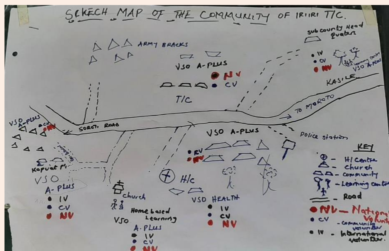
Figure 3: Workshop with Volunteers, Mapping Activity, Moroto District

The community mapping activities in Uganda were conducted in workshops with groups of volunteers and primary actors, both separately and in mixed groups. This was part of the research's participatory approach for provoking creative conversations about the realities of blended volunteering in project implementation, situating the presence of the distinct modalities in each locality. The different maps produced by participants showcase how particular volunteer combinations were located in specific local areas, as in the example of Figure 3 that shows the community of Iriri, Moroto district.