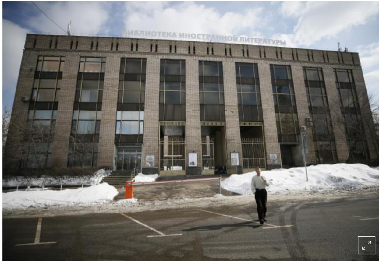
A general view shows the building of All-Russian State Library for Foreign Literature, named after Margarita Rudomino, which houses the British Council in Moscow, Russia March 17, 2018.

MOSCOW (Reuters) - The British Council said in a statement on Thursday it has been instructed by the Russian foreign ministry to cease activity in Russia and it has cancelled all scheduled events and programmes.