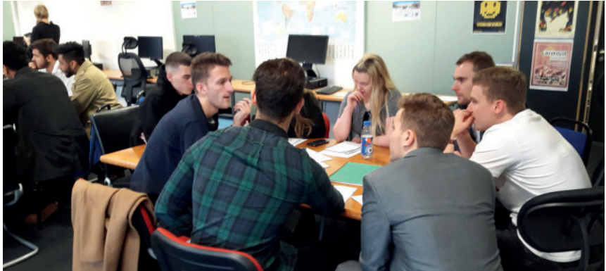
EBM and SLO students collaborate at the Northern Design Centre

Challenge in order to raise money for the Personal Support Unit (PSU). The PSU is a charity dedicated to providing free, independent assistance to people facing proceedings without legal representation.