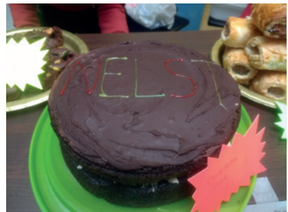
Our students created a special NELST cake as part of Great Legal Bake