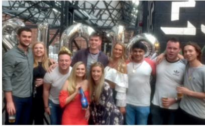
SLO end of year party organising committee and prize winners