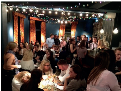
Great Legal Quiz at Nancy's Bordello

On Wednesday 14th February 2018, our students participated in the nationwide Great Legal Bake to raise money for the North East Legal Support Trust (NELST). NELST is our local arm of The Access to Justice Foundation which raises and distributes funds to support free legal advice services. The charities supported by the NELST help to facilitate access to justice for the most vulnerable and disadvantaged members of