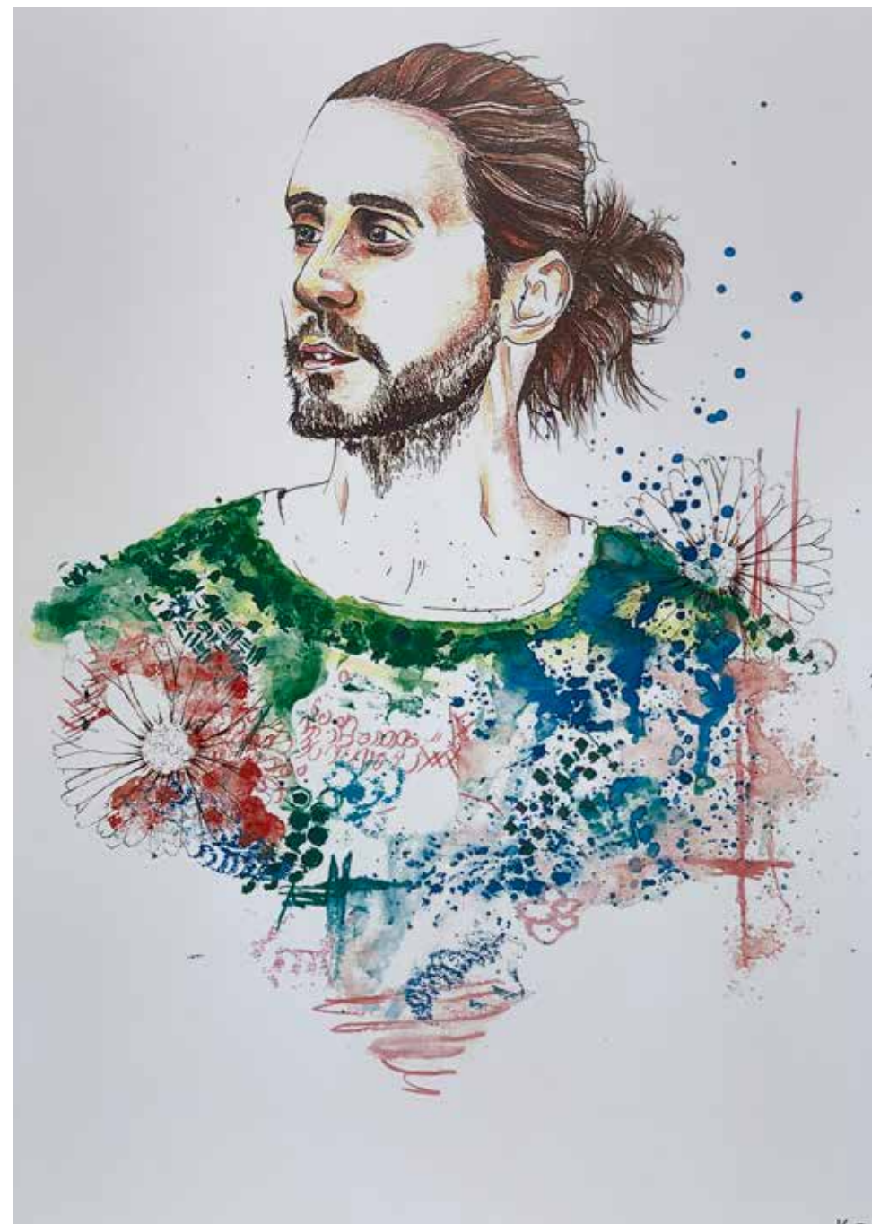
Illustration, Observational drawing, Trend