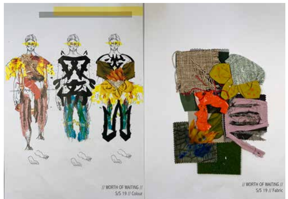
Photography, Texture, Mark making, Research, Illustration