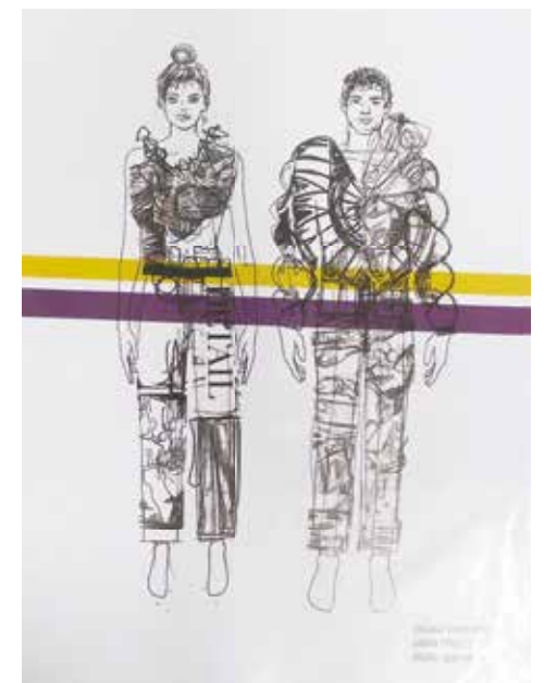
Slide 2 - Mood Board, Mark-Making, Moulage, Design Development, Collage